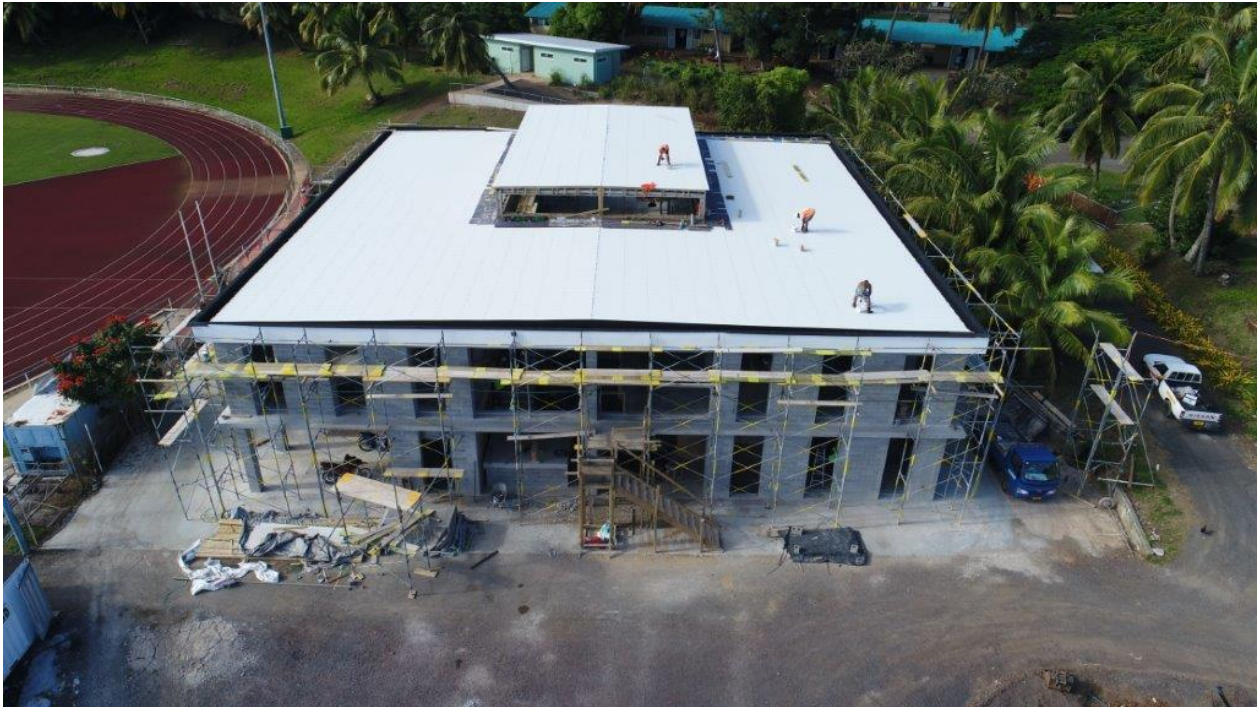
The roofing iron at the Technologies building was placed over the weekend, giving contractors more shelter to continue working under.

A partnership between the Governments of New Zealand and Cook Islands